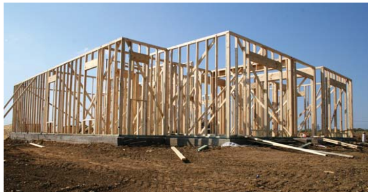
The Tax Credit Assistance Program is designed to fill existing financing gaps in Affordable Housing Tax Credit developments so their construction can be completed as quickly as possible.

the authority at its discretion to exchange up to 40 percent of its 2009 credit authority and all or a portion of the 2007-2008 returned credits with the Department of Treasury for $0.85 per credit, times 10.