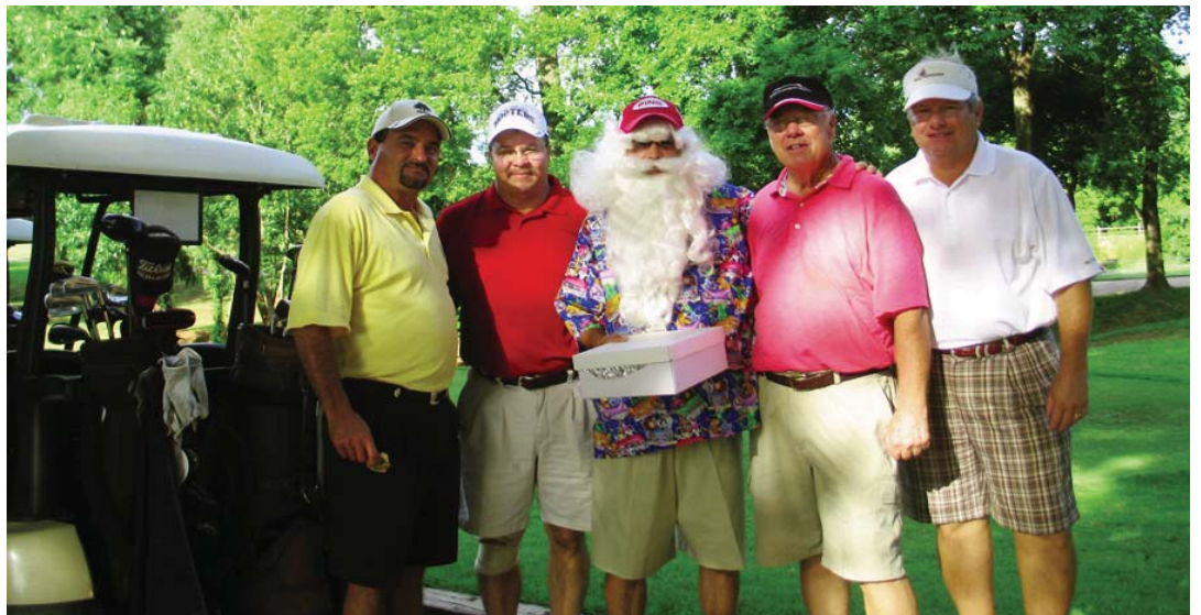
Santa visits with participants at last year's golf tournament.

Individuals and organizations can partner with Santa's Sleigh by making a monetary donation to buy presents for homeless children, by playing in the golf tournament, or by becoming a sponsor of the golf tournament.