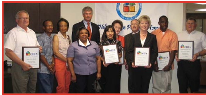
OHFA presented seven Apex Awards at the Board of Trustees meeting on July 19. Every year, the Apex Awards recognize excellence in affordable housing.