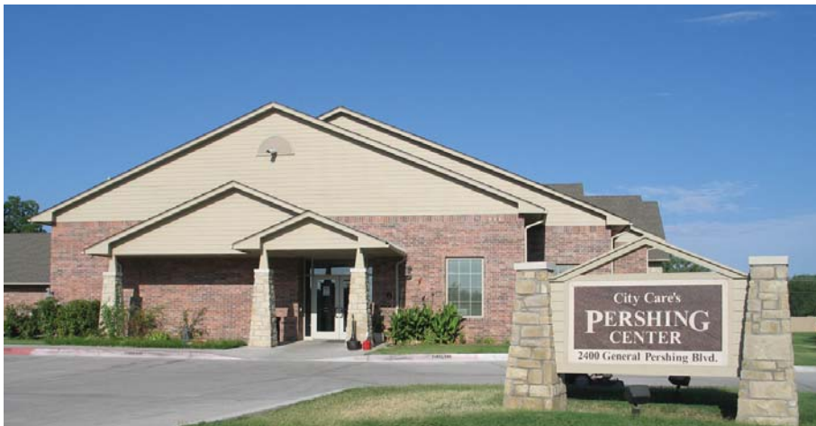
The Pershing Center in Oklahoma City runs a successful program assisting adults who are homeless obtain jobs and permanent housing.