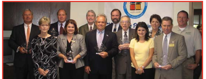
Diamond Award Recipients

Housing Connection Oklahoma Housing Finance Agency P.O. Box 26720 Oklahoma City, OK 73126